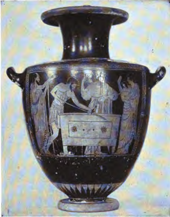
Fig. 60. Carpenter making the chest for Danaë and Perseus.

sea. The Greek poet Simonides tells of the love and despair of the young mother :